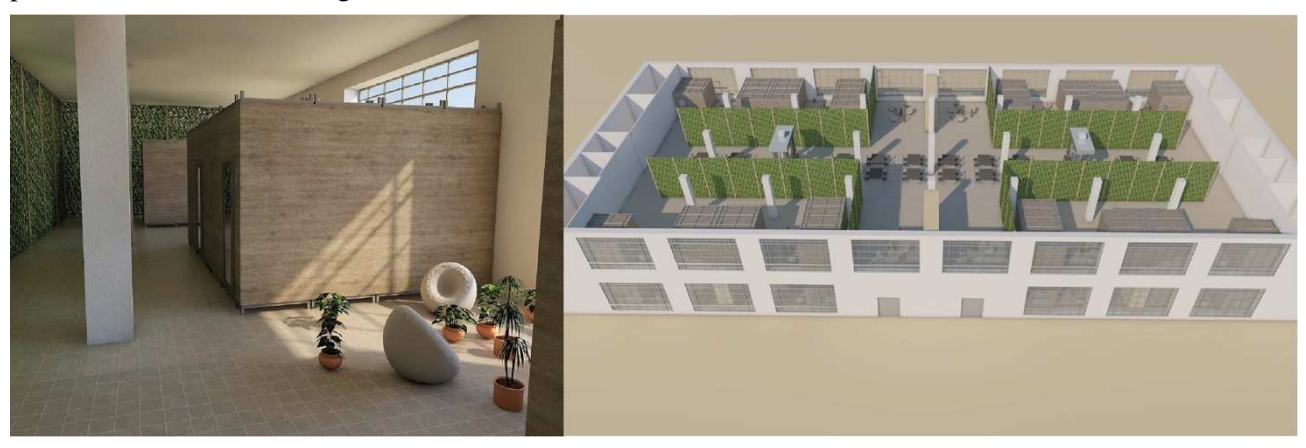
Fig. 4: Example 3 temporary housing model for scenario "Life sharing to go".

In the third potential scenario named "Life sharing to go" unused industrial or open space office buildings have been chosen as suitable environments. The benefit of adapting existing structures lies in the overall reduced impact on resource and energy use for the construction of the units. The re-purposing of these existing structures has the objective to provide a flexible and open-space area that can house temporary, lightweight, prefabricated and modular units in existing spaces and subsequently reduce the requirements on raw materials since the main structures are already there. The units are designed as easily moveable modules for fast and easy mantling and dismantling, allowing flexibility of space in a series of private and semiprivate areas as shown in Figure 4.