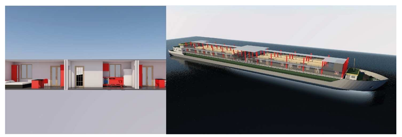
Fig. 5: Example 4 temporary housing model for scenario "DonAutonom".

A less stable and more flexible approach was considered in the scenario "DonAutonom" as this would involve the inhabitation of a redesigned and reused old cargo ship on the Danube. The ideas for the housing models involve common areas on a lower deck and three upper container decks with living units. On top of the containers a series of terraces and plant areas are foreseen in order to provide green and open spaces on an otherwise steel designed object as shown in Figure 5. The experimental setting is considered to be selfsufficient in terms of water and waste by using rain- and river water and the conversion of biogenic waste into biogas.