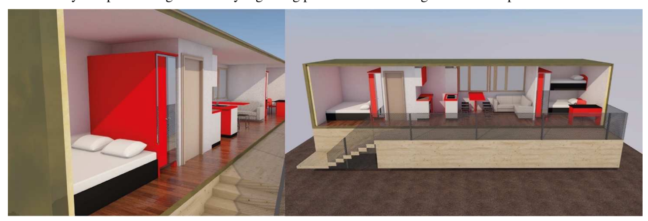
Fig. 6: Example 5 temporary housing model for scenario "Life on tracks".

Following the logic of the scenario as outlined previously in Figure 4, the scenario "Shop-Hopping Box" makes use of existing structures and addressed high vacancy rates for ground-floor retail spaces. The small-scale stores could be adapted for families or other co-habituating groups. The scenario is foreseen as a simple approach as no construction works or severe adaptations would have to take place. In the potential housing model as shown in Figure 7 the retail space is provided with new modular room divisions to create separate entities for kitchens, bath- or bedroom areas. The units are designed for swift and easy assembly and disassembly and provide high flexibility regarding placement and arrangement within potential vacant stores.