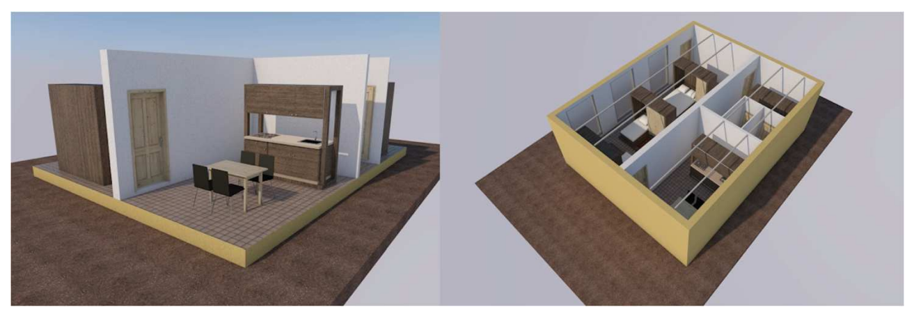
Fig. 7: Example 6 temporary housing model for scenario "Shop hopping box".

In a subsequent step, all models have been analysed based on a series of over 50 environmental, technical and social indicators in order to simulate and assess the overall suitability and sustainability of the models. From an architectural perspective, aspects such as material (e.g., durability, embodied energy) and structure (e.g., constructability and de-constructability) as well as internal comfort parameters (e.g., daylight quality, ventilation, thermal comfort) have been specifically addressed. The potential ideas for the housing models are then discussed and reviewed by an external stakeholder group to critically assess the theoretical suitability for the application case of Vienna and to evaluate if and how temporary housing can form an integral part of future planning activities related to strategic development plans and to strategic risk and disaster mitigation aspects.