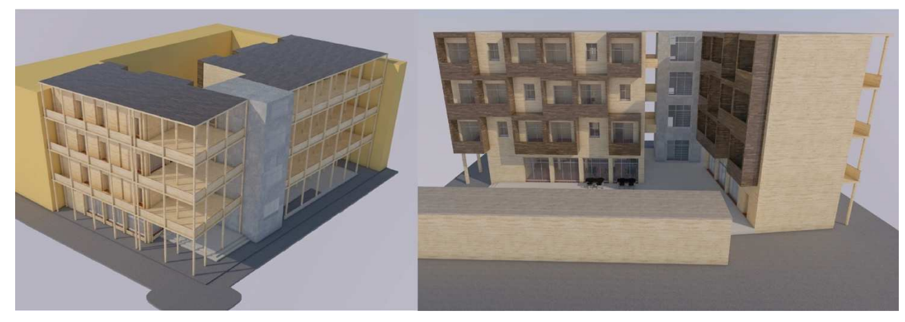
Fig. 2: Example 1 temporary housing model for scenario "Gap module".

The first scenario "Gap module" as shown in Figure 2 shows a setting for temporarily vacant building lots within urban areas with a high density. Short-term shelter can be provided in these vacant lots, at times when the area is already emptied of previous buildings but not yet ready for new construction. These plots are considered to have a usable ground floor area of around 1000 \text{m}^2 so that multi-storey structures could be erected on site. The idea is that the systems are made of highly modular, prefabricated units that are grouped together over several storeys. They can subsequently be constructed and de-constructed within a very short timeframe (i.e., less than two months on site) and with little disruption to the plot. The focus is on easily accessible plots within a densely populated area and an extremely well-established infrastructure, but to use these plots for a limited time only and with a high re-use capability of the modular elements.