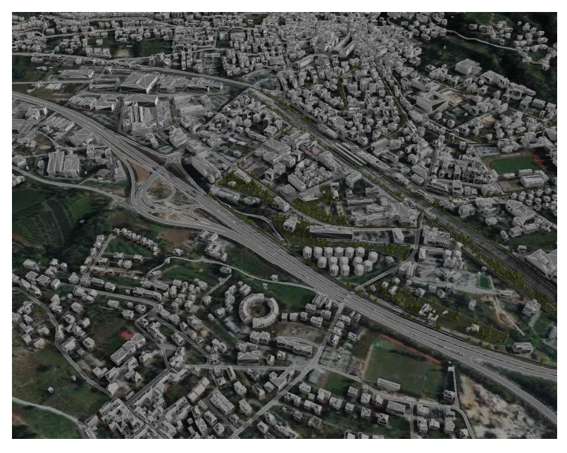
Fig. 3: The first result of the test with the students, by A.Rollandi

Then, the second ongoing test of the research involves stakeholders' participation to obtain a shared vision for the area.