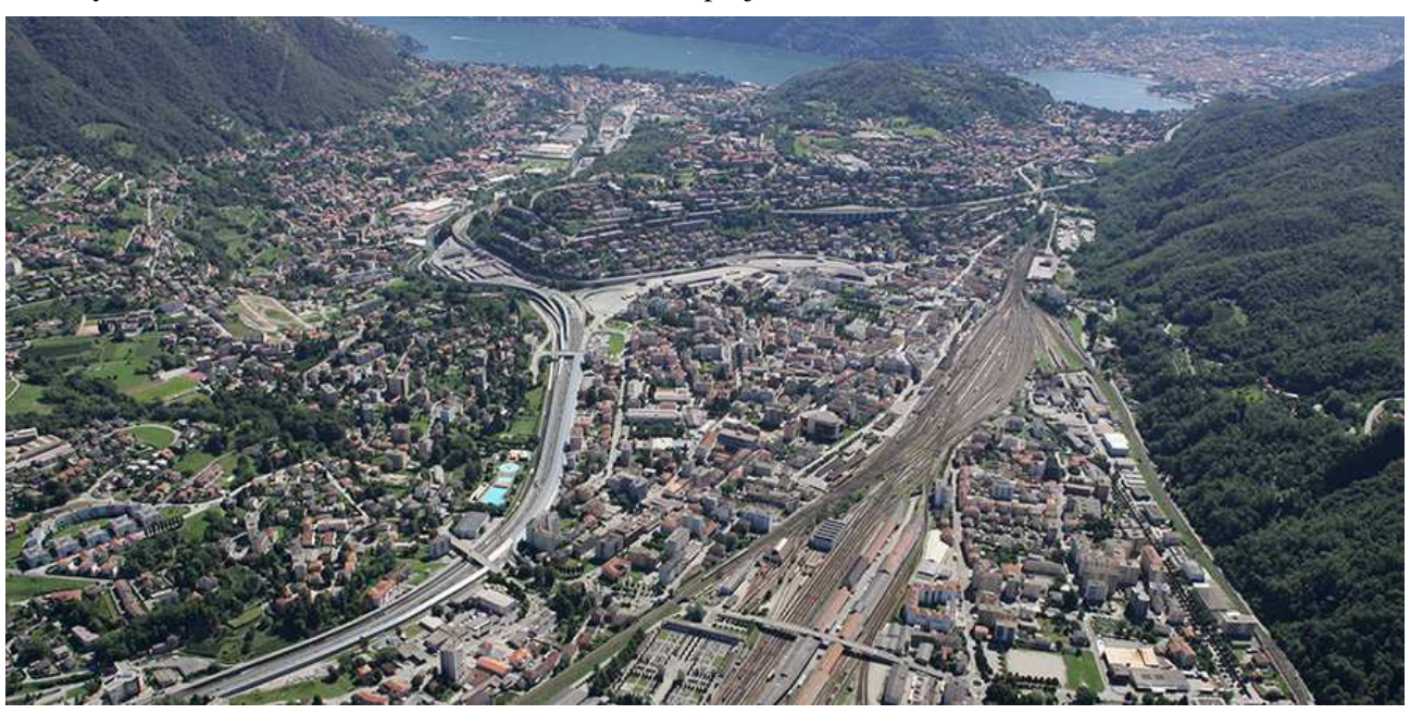
Fig. 2: Chiasso.

In recent times, a good opportunity for cross-border planning is in Chiasso. Together with Mendrisio, in recent years, he has been interested in various cultural projects with a cross-border character.