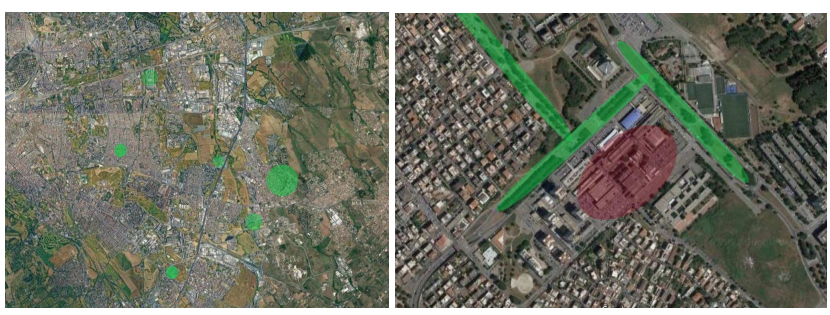
Fig 6: Organizing and completing green lines in high-risk area and Equipping residential centers and creating local parks

mortality. Suitable landscape criteria for a green space or neighborhood are the proper distribution of routes, access, granulation, suitable urban furniture, and the form of the landscape. The human-nature interaction examines the amount of need or communication needed for a healthy and sustainable urban environment in each district. In an area like Torre Angela with a high number of positive cases during the Covid-19, the Presence of adequate but unorganized green space is also a potential option. With reorganize and equip those green areas, the sense of satisfaction could be increase and motivate the dwellers to spend some minutes walking every day. It is possible to help raise the level of health by allocating urban furniture, defining the sidewalk, and establishing adequate health services along the way.