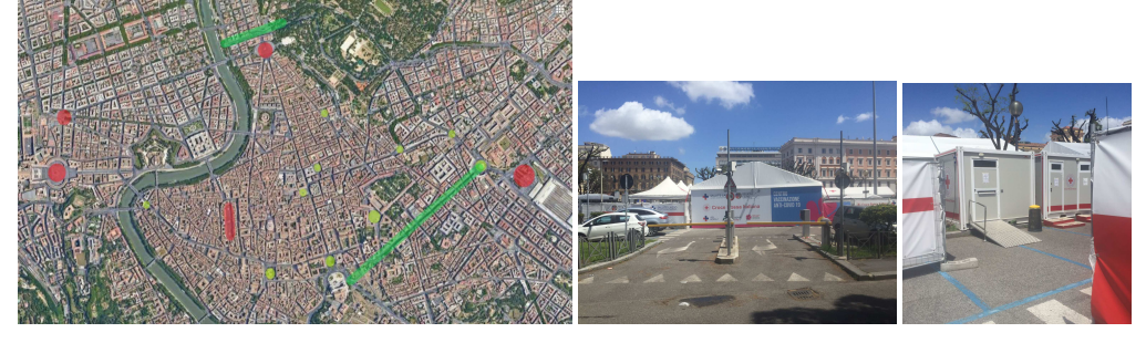
Fig 7: Locating and Establishment of mobile hospitals in the main squares of the city

(5) The presence of three hospitals at a distance of fewer than eight kilometers (Tor Vergata, Casilina, and Rome American Hospitals) in the surrounding districts, indicates the presence of health centers close to there, but does not seems enough in an emergency. Some urban open spaces with the ability to become a temporary hospital will be one of the solutions. Uncovered parking lots near metro stations or in the open areas allow temporary locations to be built.