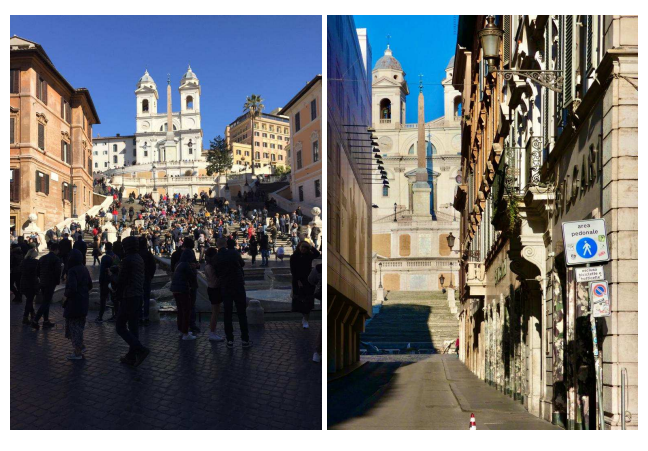
Fig. 1: Spanish Steps, before and after Covid-19, photos by authors.

Rome's 2021 population is now estimated at 4,278,350. About 9.5% of Rome's population is non-Italian. Half of which is the immigrant population of European origin, most notably Romanian, Ukrainian, Polish, and Albanese, comprising a total of 4.7% of the population. The other 4.8% is comprised of immigrants with non-European origins, particularly Filipinos, Bangladeshis, Peruvians, and Chinese. In 1950, the population of Rome was 1,884,065 which has grown by 21,294 since 2015, representing a 0.50% annual change. These population estimates and projections, come from the latest revision of the UN World Urbanization Prospects. These estimates represent the urban aggregation of Rome, which typically includes Rome's population in addition to adjacent suburban areas.