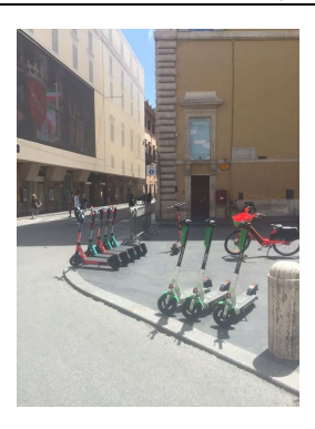
Fig 3: scooter station in Rome

(2) The use of masks for citizens can be considered in terms of social effects, the effects of people's views on the use of face masks, the reason for not using masks, the most important and practical methods to solve the problems of utilizing face masks. The performance of research centers and Health centers indicated the factors and executive strategies for using the mask.