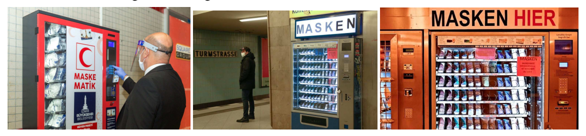
Fig 4: Mask station in Europe

(2) The use of masks for citizens can be considered in terms of social effects, the effects of people's views on the use of face masks, the reason for not using masks, the most important and practical methods to solve the problems of utilizing face masks. The performance of research centers and Health centers indicated the factors and executive strategies for using the mask.