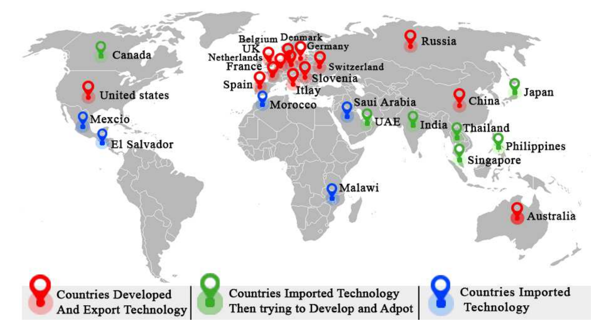
Fig 2 The world map showing international 3DP examples: countries which developed and export technology countries which import technology, develop and adopt it, countries which import technology (Compiled by the authors, sources are cited for each example)