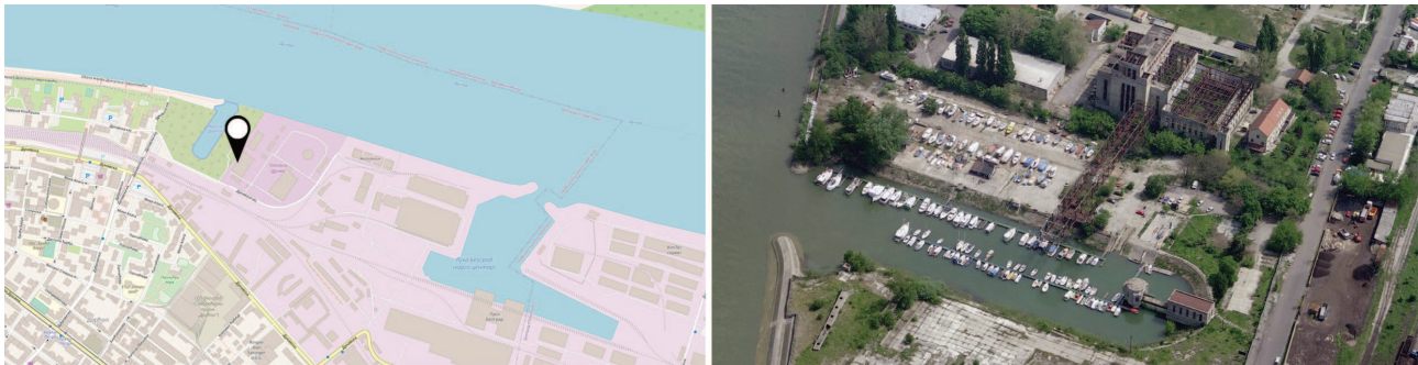
Fig. 3: The position of the Thermal Power Station in relation to the immediate environment (left) and the aerial view (right).

The complex of the Thermal Power Station "Power and Light" was built between 1930 and 1932, by the Swiss Basel-based Electrification and Transport Society. The Thermal Power Station complex consists of several buildings: the main cubic power station building, the portal crane, the pumping station, and the water filtering plant. The main building has three functional units, which are visible in terms of construction and design: the boiler room, machine hall, and control room (Mihajlov, 2011). The Thermal Power Station has been out of function since 1969. Due to its cultural and historical values, but also values in the architectural and urban sense, the Thermal Power Station "Power and Light" has the status of a cultural monument.