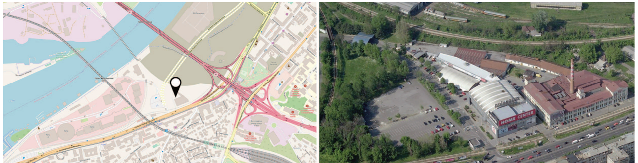
Fig. 2: The position of the Milan Vapa's Paper Mill in relation to the immediate environment (left) and the aerial view (right).

The Milan Vapa's Paper Mill was designed by architect Karl Hanisch and built-in 1921–24. The development of the Serbian economy in this period was significantly contributed by the construction of this factory, which at that time belonged to the category of large and modern industrial companies that can compete with factories of this type located in developed European countries (Mihajlov, 2010). Due to its cultural, historical, architectural, and urban values, the Milan Vapa's Paper Mill has the status of a cultural monument. Mihajlov (2010) states that The Milan Vapa's Paper Mill from the urban aspect testifies to the existence of one of the first extremely important zones intended for the industry in Belgrade, while its representativeness indicates the importance of an architectural design of industrial buildings in that period. After the cessation of paper production during the 1950s and the relocation of the factory to another location, the factory building was converted into a business facility.