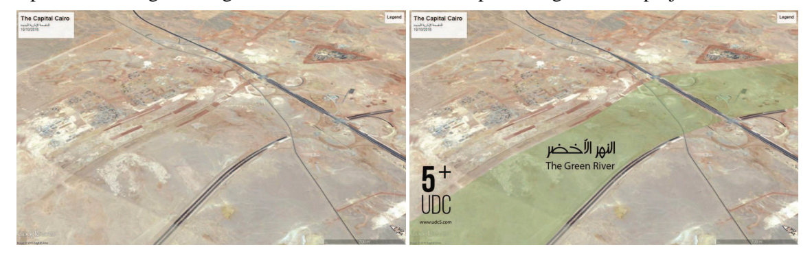
Fig. 2 illustrates the real situation (on the left) vs the schematic proposal of the green river in the new adminstrative capital (on the right).

or intensity of land use and the landscape character is one of the consequences of landscape change (Wood & Handley, 2001). It can be said that the dysfunction that the new administrative capital is facing, is the main landscape change driver, as illustrated in Figures 2 and Figures 3. Dysfunction destroys the character of landscape which is defined by the discinctiveness of landscape elements. This process can impose an inappropriate development pattern on the landscape through forces such as suburbanisation and intensive development (Wood & Handley, 2001). The distinctive elements of the desert landscape are being erased and substituted by the envisioned reality by the state that may be driven by the need of guaranteeing success and attracting the people from the centre to meet the main goals of this project. In this case the state is relying on the strong socio-cultural identity of the Egyptians and their desperate need of greenery in comparison to the great deprivation facing the congested centre of Cairo to accomplish the goal if this project.