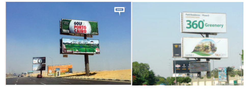
Figure 4 illustrates the billboards spread all over the capital, advertising for golf courses and lush green based residences. Sourxe: https://insiteooh.com/article/2380-porto-group-launches-their-newest-project-in-mostakbal-city

case here. The advertisments are sending deceiving and distorting messages of the new natural desert identity to the public, totally opposed to and distant from their Nile valley identity. Worse still, these images are linked to a westernised utopia. Hence these implications are not only environmentally destructive but they are also culturally and socially antagonistic.