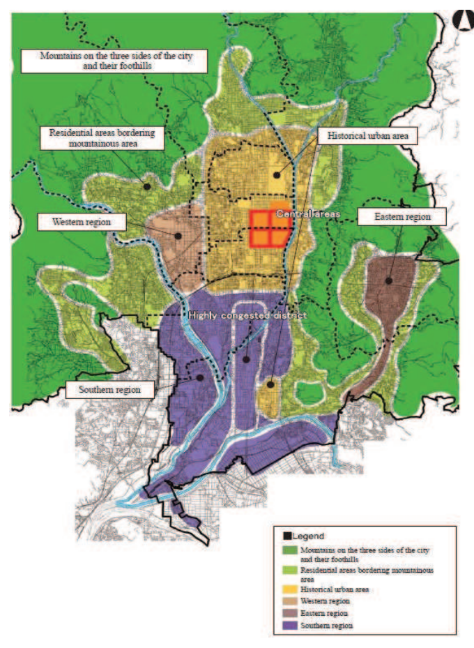
Fig.3: Kyoto, City Planning

Kyoto is located in the Kansai region of Japan, was previously known as Miyako, and is the capital of the southern part of Kyoto prefecture. The city with a population of 1.47million, is popularly known for new cultural capital, research and learning centers. The city is best known for its history for being the old magnificent capital of Japan for one thousand years. The city planning concept and framework of Kyoto have seen various historical changes during and later world wars. On one hand, the city is home to 40 institutions of higher education and top universities such as Kyoto University. On the other hand, the city is the finest piece of preservation in Japan which has around 2,000 religious places, 1,600 Buddhist temples and 400 Shinto shrines, additionally palaces, scenic landscaped gardens, clean water bodies and architecture intact. Tourists are immensely affectionate of Kyoto canals that line a portion of the older well-carved streets with a gridiron pattern. The historic monuments of ancient Kyoto are recorded by the UNESCO as a world heritage site, has increased tourists which have further strengthen the city's economy. It is also the city of manufacturing for many luxury items or Japanese crafts such as Japanese Kimono.<sup>3</sup> These weavers are produced by the local people in their plants, nevertheless, such businesses have been declined in the last few years.