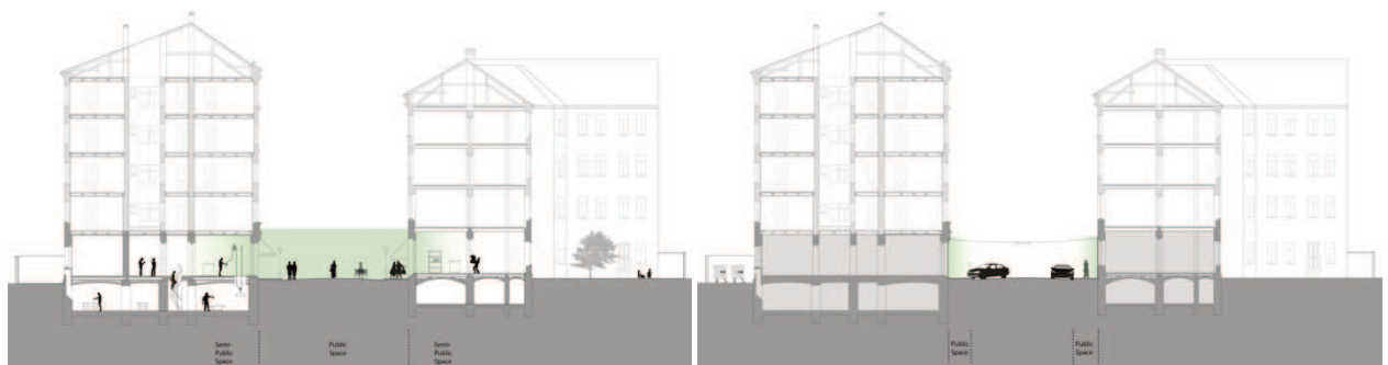
Fig 6. Section views of the StadtParterre of the 1910-status and the current status; while the historic StadtParterre functioned as a uniform, inter-connected structure, the exchange between the various zones is no longer given today.