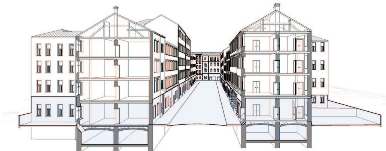
Fig. 1: The Urban Parterre Model.