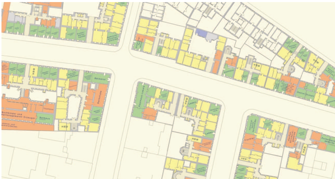
Fig 4. UPM showing the use structure analysis for historic status – around 1910. © Psenner 2017

The information of the afore mentioned house biographies is being processed by including the various use categorizations of all single ground floor premises and by utilizing a special colour code: green representing semi-public use (with high use frequency and direct connection to the public street space); orange : production, yellow : living, grey : storage and blue : garages. The Revit® tool “Rooms” is used to mark this reference within the building model based on room-bounding elements. Thus, the model offers highly detailed, multi-dimensional information. Which also explains why throughout the development of the methodology data managing had become a number one feature.