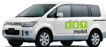
Figure 1: ISTmobil vehicle

Another important aspect is to foster cooperations and increase coordination of the different mobility services, which leads to the pooling of regional transport providers.