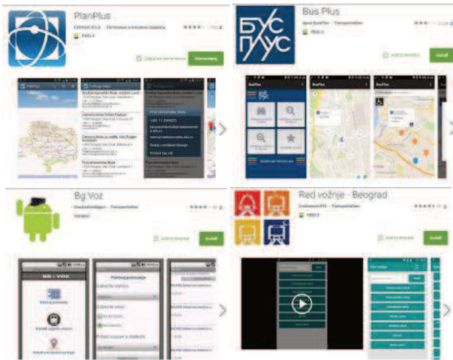
Fig. 3: Applications dealing with public transportation, time-table and preferred connections.