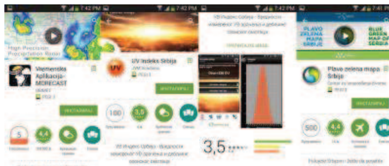
Fig. 6: The applications focused on weather data and natural resources - 'MORECAST', 'UV indeks Srbija', 'Blue Green Map of Serbia'.

Apart from these interfaces which have to be further developed in order to include more environmental features, the Center for environmental improvement has developed several applications (e.g. 'MORECAST', 'UV indeks Srbija', 'Blue Green Map of Serbia') which include information about weather, precipitation, UV radiation, the ozone layer or natural resources. They provide another kind of information which could be used both by citizens and tourists, raising environmental awareness and stimulating trend of biophilia.