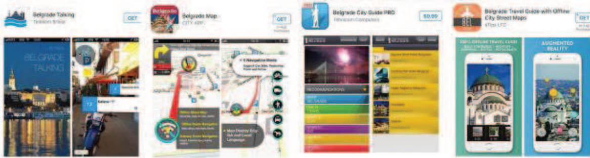
Fig. 2: Applications 'Belgrade Talking', 'Belgrade Map', 'Belgrade City Guide', 'Belgrade Travel Guide' - providing a better experience and movement in the city.

There are also several web-sites and mobile application more specialized and focused on urban mobility. 'Belgrade Plan Plus' represents the official and most used internet site for wayfinding in Belgrade. It offers a digital map with streets, connections and important places. 'Bus Plus', the internet site and mobile application is used as a payment tool for the public transport in Belgrade in the form of a smart ticket system in which consumer can upload money for transport fees, depending on the type of card (personalized, paper and electronic card). Simultaneously, there are several apps and sites concerning the public transportation in Belgrade and its timetable. For example, 'BG voz' is the internet site and mobile application about Belgrade train system. It offers information about arrivals, departures, nearest stations, or the progress of expected train. 'Red voznje - Beograd' has a similar content, but it covers all types of transportation.