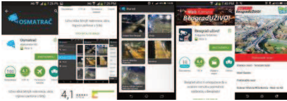
Fig. 1: Applications 'Observer' and 'Belgrade Live', a possible base for the future smart urban performances: the use of real-time data as a tool for improving the environmental quality and efficiency of urban services.

There are also several web-sites and mobile application more specialized and focused on urban mobility. 'Belgrade Plan Plus' represents the official and most used internet site for wayfinding in Belgrade. It offers a digital map with streets, connections and important places. 'Bus Plus', the internet site and mobile application is used as a payment tool for the public transport in Belgrade in the form of a smart ticket system in which consumer can upload money for transport fees, depending on the type of card (personalized, paper and electronic card). Simultaneously, there are several apps and sites concerning the public transportation in Belgrade and its timetable. For example, 'BG voz' is the internet site and mobile application about Belgrade train system. It offers information about arrivals, departures, nearest stations, or the progress of expected train. 'Red voznje - Beograd' has a similar content, but it covers all types of transportation.