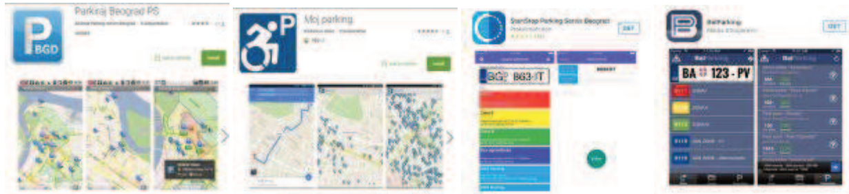
Fig. 4: Applications focused on the problem of parking - capacity, availability, routes and prices.

Several apps in Belgrade offer information about parking places, zones, and capacity in different areas of the city (e.g. 'StartStop Parking Servis Beograd', 'BelParking', 'Parkiraj Beograd PS' and 'Moj Parking'). The application 'Moj Parking' (My parking) is especially interesting because it also provides information on parking capacity and places for disabled.