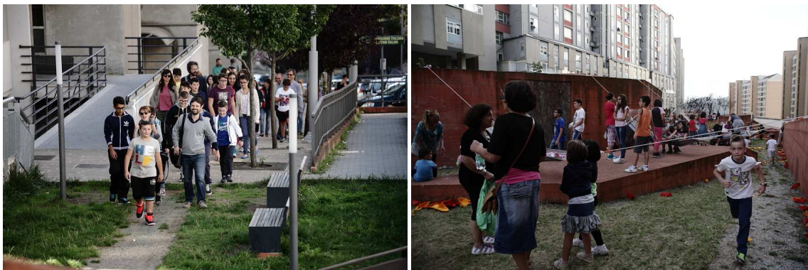
Fig. 3 (left): Workshop participants guide students from school to the "ship". Fig. 4 (right): The Solarium, "space created during the workshop, attracts children and local residents.

The result was a surprising, large and inventive list of opportunities, emerged at first with suspicion, gradually with a lively succession of proposals. Several opportunities have been immediately concretised, animating the park with games and meetings, which have demonstrated with simple and instantaneous concreteness, the possibility to live the ship and its garden, only apparently unfriendly. Others have produced micro-places, made by workshop participants with the inhabitants, realizing basic gardening activities (selective cuttings of tall grass, pruning of existing trees and removal of dead ones, planting a precious Liriodendrum tulipifera , arranging seasonal flowering plants) and setting up spaces for games (a sandy track for bowls, a mini football, volleyball and basketball fields). The strength of these operations, although so minute, was to evoke a spontaneous mark of names: the Solarium, the Playground, the Ascent, the Well, the Mirador, indicated by signposts on original drawing, immediately become meeting places.