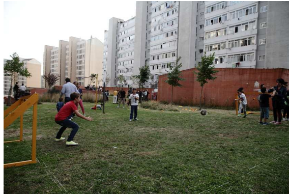
Fig. 5: Few games built by workshop participants were enough to bring the neighbourhood children on the ship.

be the whole neighbourhood, which consequently was imagined such as a swarm of ships and boats, arriving and departing from somewhere.