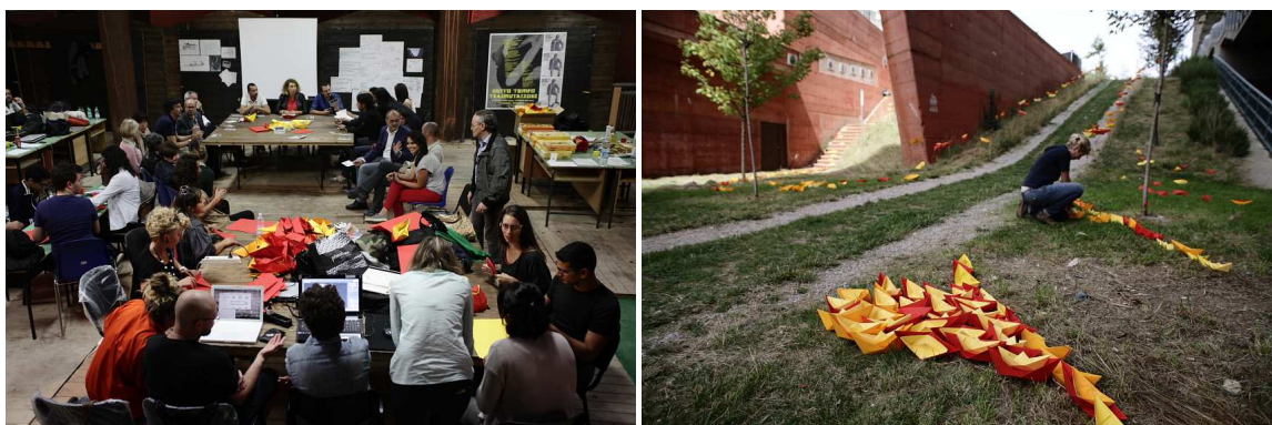
Fig. 6 (left): In the cargo of the "ship" workshop participants, neighbourhood residents and members of municipality administration building paper boats. Fig. 7 (right): The small boats invade the roof garden of the "ship", defining paths that lead to the various activities undertaken.

A further issue has been added: the ship cargo, a generous space for quantities of certain beauty never used except as improper deposit. At the port inauguration, the ship opened its cargo space and showed its shipment: an instant-exhibition of videos reporting the neighbourhood, realized by workshop participants, and wonderful images by the photographer Salvatore Laurenzana.