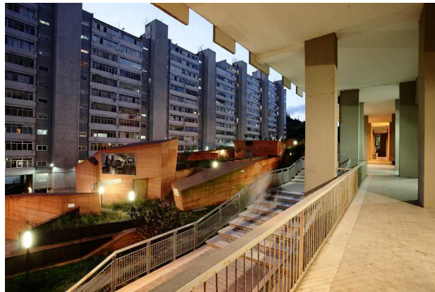
Fig. 2: A view of the "ship" from the arcades of "Serpentone"; the ship inhibits correct lighting to the first floors of “Serpentino”.

The idea of the park, the metaphor of the ship and the rocks appear distant and elusive. This ship stranded between two large buildings, “Serpentone” and “Serpentino”, caused the occurrence of significant problems. Partially obstructing the only way crossing the neighbourhood, compromising accessibility because the interventions of the road annular network have been realized only partially. Furthermore, the impressive body of the concrete ship inhibits correct lighting to the first floors of “Serpentino”