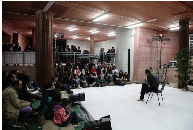
Fig. 8: The ship cargo has become the stage for performances of "City Festival of Hundred Stairs".

Continuing the Buddhist metaphor, the empty "quarry", was intended as figures background that show their contours only through the reciprocal action between them, interaction guaranteed and made possible by the same background. The potential of that "empty" space has been used not only during the workshop, but also as a result, some activities of the City Festival of Hundred Stairs, which deals with dance and performative arts, were made in N.Av.E..