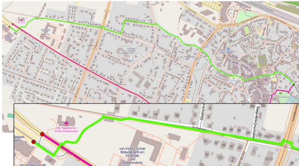
Fig. 3: Comparison of the routes obtained for different cartographies (OSM and City network in Soest).

Every time a user wants to create a new route, the request comes from the CreateItinerary web service. This request contains an origin and destination pair of coordinates (green points can also be used). The best cartography available is chosen automatically if both exist (OSM and City). In the Figure3 below, the two cartographies were tested manually to see the different results obtained in Soest.