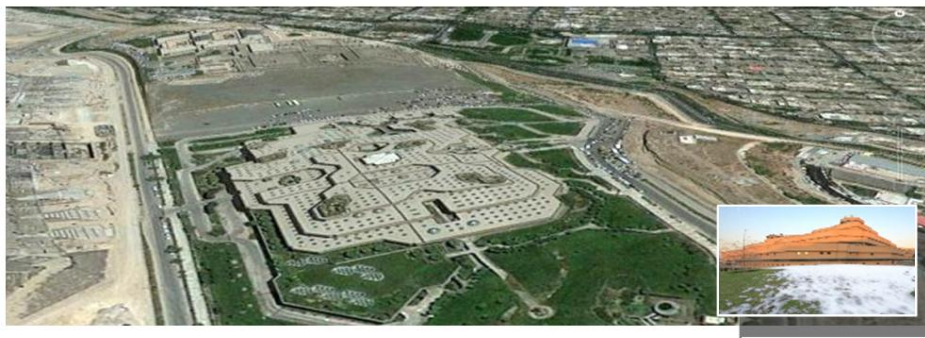
Figure 1: a view of National Iranian Library building (derived from Google Earth software)

Use of uniform repetition of buildings (construction of uniform buildings) is one of the other subjects studied in this field. Residential and modern and future high buildings beside Evin Hotel (figure 2) and Ekbatan Residential Complex as the fourth Strategic Rings are of these class. Construction of spaces with geometrical and regular shapes facilitates identification of target from the surrounding environment.