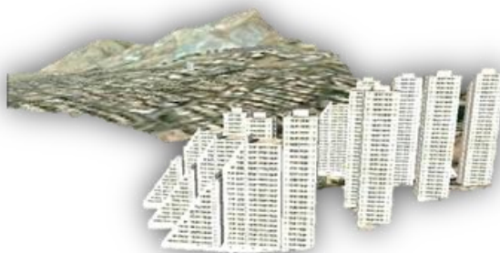
Figure 2: a view of future buildings (derived from Google Earth software)

Use of uniform repetition of buildings (construction of uniform buildings) is one of the other subjects studied in this field. Residential and modern and future high buildings beside Evin Hotel (figure 2) and Ekbatan Residential Complex as the fourth Strategic Rings are of these class. Construction of spaces with geometrical and regular shapes facilitates identification of target from the surrounding environment.