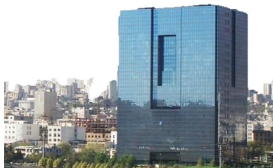
Figure 3: a view of Bank Markazi building

In morphological terms, weakness of Tehran metropolis is expansion of use of glass and aluminum view of office and governmental buildings due to easy installation and low cost price and this facilitates scattering of radar waves and identification of target. The known glass building of Ministry of Agricultural Jihad located in Keshavarz Blvd. as one of the first strategic rings and building of Bank Markazi (figure 3) have this feature.