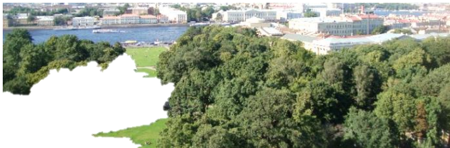
Figure 7: layout of large-scale green space among Moscow urban texture

One of the other strategies in this field is use of open and green space in the city (figure 7) which is not available in Tehran metropolis.