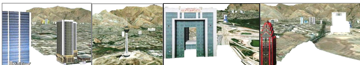
Figure 4: tendency to indexing in Tehran metropolis (derived from Google Earth software)

One of the weaknesses of Tehran relating to principle of concealment is widespread tendency to indexing and construction of symbols and signs (figure 4). After attack of twin high buildings in 11 September, it seems that skyscrapers have lost their attraction in developed countries because terrorist is aware of power symbols (Briggs, 2005).