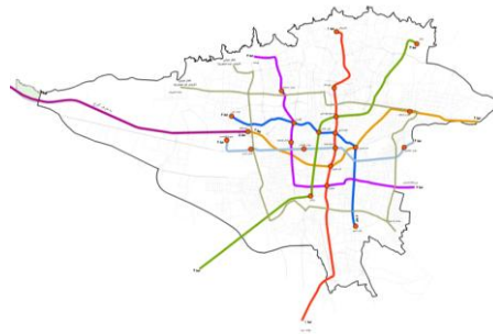
Figure 6-the present and future rail lined of Tehran city (Boom Sazgan Consulting Engineers, 2006).

One of the other strategies in this field is use of open and green space in the city (figure 7) which is not available in Tehran metropolis.