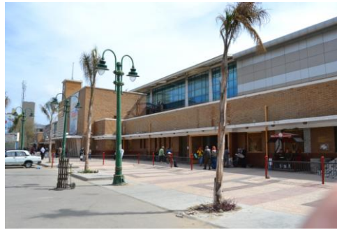
Fig. 6 The new facade with new finishing materials over the old train station building causing aesthetic pollution.

From another point of view, the new design had to encompass the old building and to cope with it in harmony, which was never accomplished in reality, fig.6.