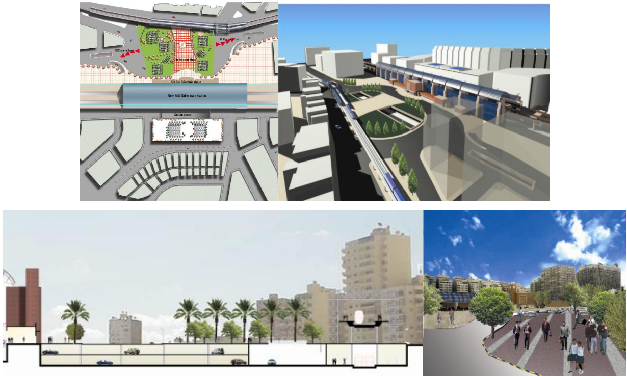
Fig. 10 the proposed plaza in front of the train station to solve the problems resulted from the new development project of Sidi Gaber.

The proposed project composed of either greenspaces represented in vegetated land or water elements and greyspaces represented in paved or hard landscaped areas with civic function can be an enhancement to the urban structure of this central crowded part of Alexandria, Egypt, fig.9.