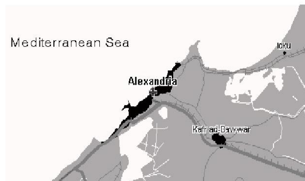
Fig. 1: Area of Study.

Alexandria witnessed a continuous urban growth from the beginning of the Mohammed Ali era (1805) up to the present time. In 1905, Alexandria's 370 thousand inhabitants lived in an area of about 4 km 2 between the two harbors. Since that time the city has expanded rapidly, eastwards and westwards, beyond its medieval walls. It presently occupies an area of about 300 km 2 and has a ten-fold increase in population at 4million, with a density exceeding 1,200 per km 2 . 2 Population is projected to become 5.4 million by 2015 (Figure.2). Because of this, Alexandria is the second largest urban governorate in Egypt. At an international level, the city was ranked 62 in 1996 and it is predicted to become rank 54 by 2015. 3 This enormous urban growth requires precise detection with good management, prediction and planning to solve circulation and traffic problems especially in the city center.