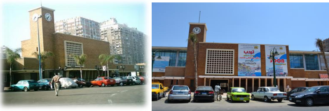
Fig.3: the old and new facades of Sidi Gaber station.

The famous train station building has a special architectural style and unique Dutch character building that was constructed instead of the traditional old wooden one, in 1948 and was built with yellow brick. The station is distinguished with a clock tower, and major map in front of it a showing the main streets of the city of Alexandria and the most important tourist attractions.