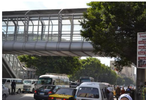
Fig. 7 the pedestrian bridge that in reality is not used by people.

Pedestrians usually cross the street from extremely critical access that is in conflict with vehicles traffic. In order to eliminate such behavior, the local authority constructed a pedestrian bridge and escalators that in reality are not used by pedestrians according to previous studies, fig. 7.(7)