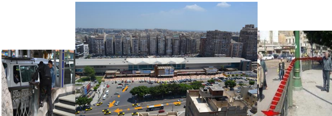
Fig. 9: Different circulation flow of people going to and from station with an obvious disorder.

Norman Foster design in Santa Giulia provides a very safe pedestrian condition, thanks to the addition of clear walking paths and the public surveillance from the presence of stores. 9