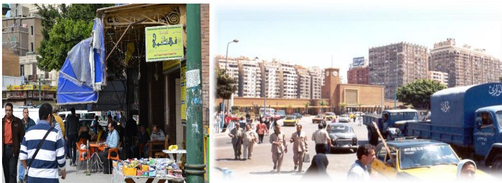
Fig. 8 : Pedestrians crossing Horreya street to arrive at Sidi Gaber with higher flow.

In urban spaces, people must be the decision makers, and they are free to choose their next steps. Where spaces are supposed to be designed to meet pedestrians’ needs and support their activities. Most of our urban spaces are not giving pedestrian movements the enough priority and that cause a mis-use problem.