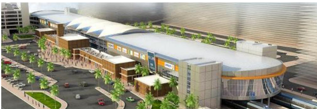
Fig. 4 Perspective of the new project as shown in advertising