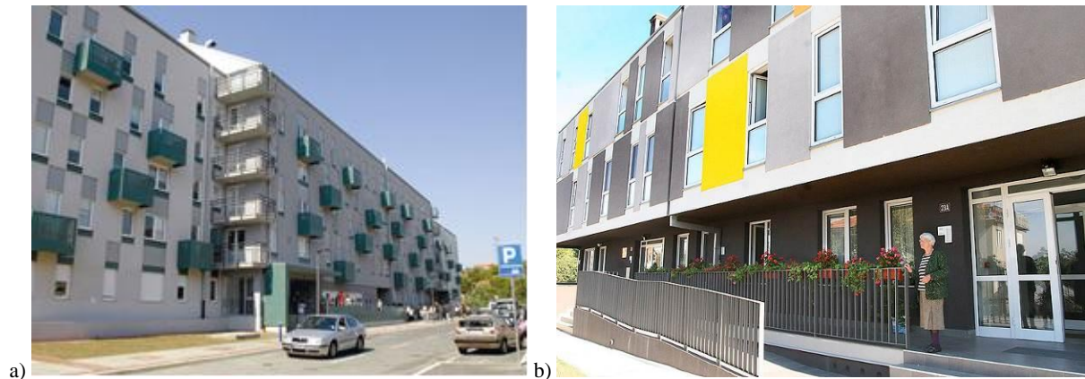
Fig. 7: Social apartments in Belgrade – a) settlement Dr Ivan Ribar and b) Mali Mokri Lug, both built in 2012.

Simultaneously, with the construction of social-non-profit flats started the construction of social apartments for renting to people in state of social need in locations: settlement Dr Ivan Ribar (Fig. 7a), Kamendin and Veliki Mokri Lug (Fig. 7b). From the beginning up to today 450 social apartments has been built in Belgrade.