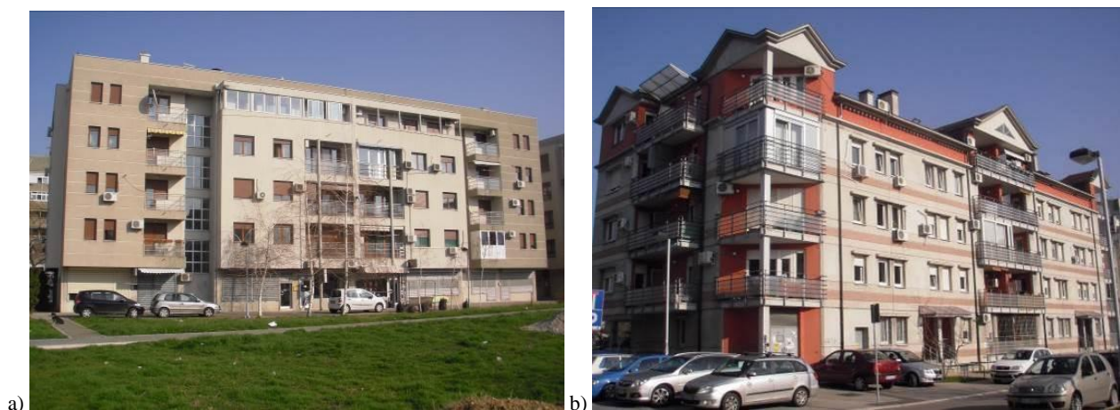
Fig. 5: Social-non-profit apartments in Belgrade – a) Retenzija built in 2006 and b) Vojvodjanska street built in 2007.

First of such projects was "Project of 1100 flats in Belgrade" in 2003. This project was accompanied by the Decision on conditions and manner of disposal of apartments built according to project "1100 apartments in Belgrade". 10 The ownership of apartments would be still in the governmental hands, but the City of Belgrade could offer it for sale (1000 flats so-called "cheap flats") or rent for the certain period of time to the persons with clearly defined social needs (100 flats – Public Rented Housing), Project was done on the basis of analysis of various available locations owned by city Council, namely Cukaricka padina, Retenzija (Fig. 5a), Vojvodjanska Street (Fig. 5b) and Olge Alkalaj Street. The project was finished by 2007.