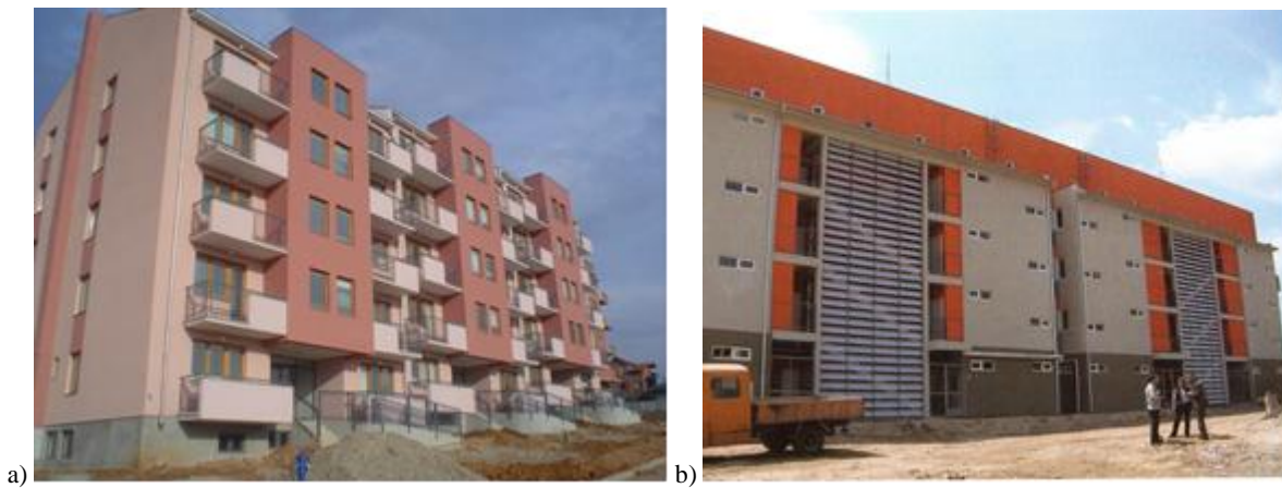
Fig. 2: SIRP programme – Social housing in a) Nis built in 2007 and b) Kragujevac built in 2007.

Although social housing buildings were built at urbanistically and morphologically different sites (Fig. 1, Fig 2, Fig. 3 and Fig. 4), thus unique and recognizable, there are some common characteristics of these sites and buildings, such as: