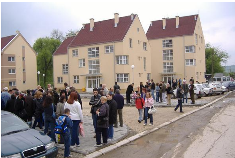
Fig. 3: SIRP programme – Social housing in Cacak built in 2008.

User households that were chosen through a transparent system of criteria and selection rules are: refugees, former refugees and local socially endangered population (single parents with children, homeless, families who lived in the inadequate housing conditions, etc.), which means that a social mix have been achieved, according to the European social housing practice.