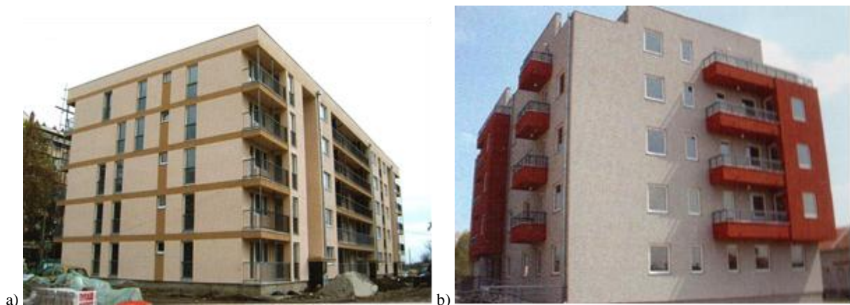
Fig. 1: SIRP programme – Social housing in a) Pancevo built in 2008 and b) Stara Pazova built in 2007.

The series of architectural and urbanistic competition were held during 2005 and 2006 in order to get the best design solutions for the social housing buildings. Serbian architects showed great interest on this topic, which resulted with over 130 competition entries in total that were disposable on the seven SIRP competitions.