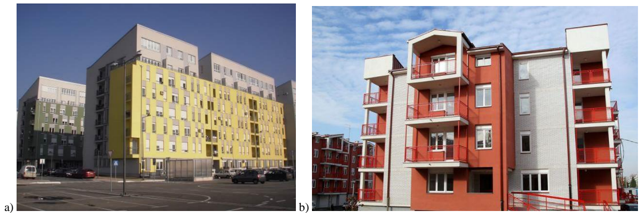
Fig. 6: Social-non-profit apartments in Belgrade – a) settlement Dr Ivan Ribar and b) Vojvodjanska street, both built in 2012.

Simultaneously, with the construction of social-non-profit flats started the construction of social apartments for renting to people in state of social need in locations: settlement Dr Ivan Ribar (Fig. 7a), Kamendin and Veliki Mokri Lug (Fig. 7b). From the beginning up to today 450 social apartments has been built in Belgrade.