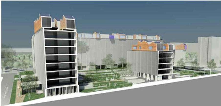
Fig. 7: The project of SMTstudio Architetti Associati

look through colors and scents . With regard to housing, those places in the plans arcades are characterized by high flexibility: each unit has secured a double cross ventilation, exposure to light and great views. The accommodation located on the roofs are equipped with balconies on both sides and are open on the greenhouses of the common terraces.