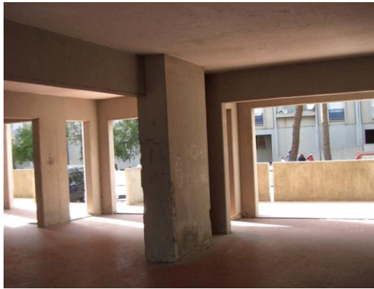
Fig. 5: An example of empty space at ground floor at Tiburtino III

a new demand of residential quality in the areas build under the social housing law of 1962 n.167. It expresses a demand of maintenance of old housing stock on one hand, and on the other hand a demand of facilities.