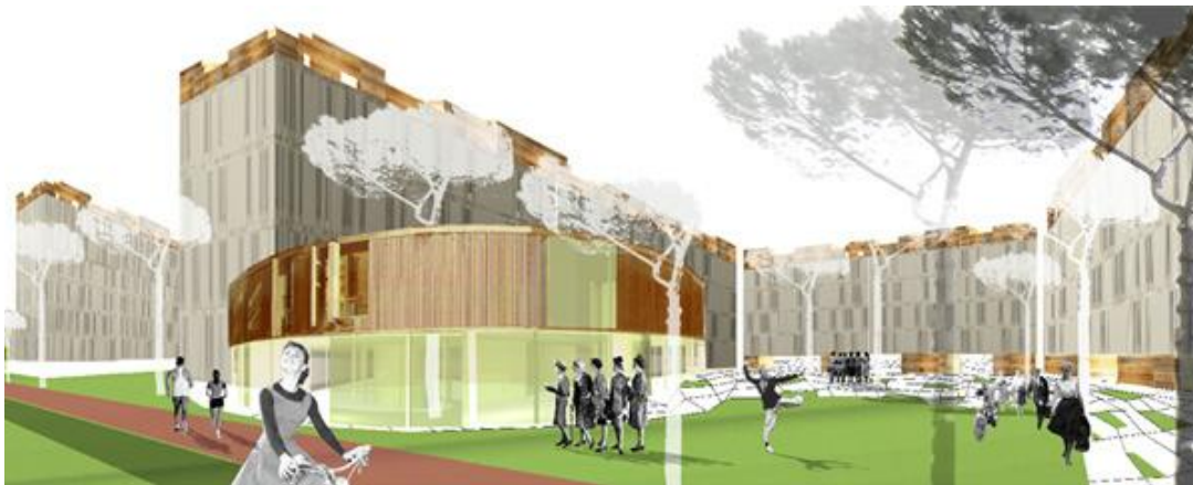
Fig. 6: The project of Espegel-Fisac

The unit plans at porch floor, however, is formed instead of a central core that contains all the technical installations and wetlands, while the living spaces open onto private terraces, private conceived as ideal extension of the public green in front of the rooms bed, facing instead on areas behind, protected by vegetation belts. For the redevelopment of the existing facades has been proposed a modular prefab that clips to the existing structure, a ventilated flat panels. In correspondence of the lodges and the windows, the system allows to create "blades" openable and closable to adjust the amount of solar radiation, the ventilation and the level of external view.