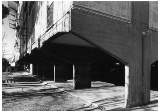
Fig. 4: Unité d'Habitation of Tuscolano in Rome -Adalberto Libera in 1950

architecture, including Adalberto Libera and in 1956 publishes the third booklet "Guide for the examination of the INA CASA projects to be implemented in the second seven years.