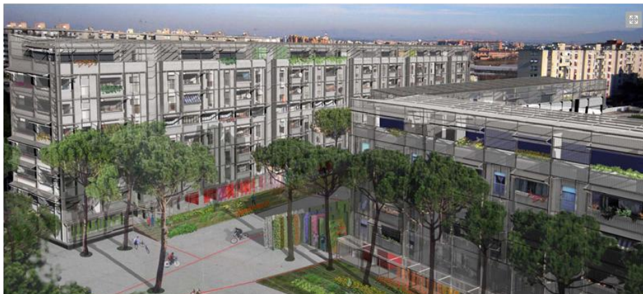
Fig. 8: The project of Molestina Architekten firm