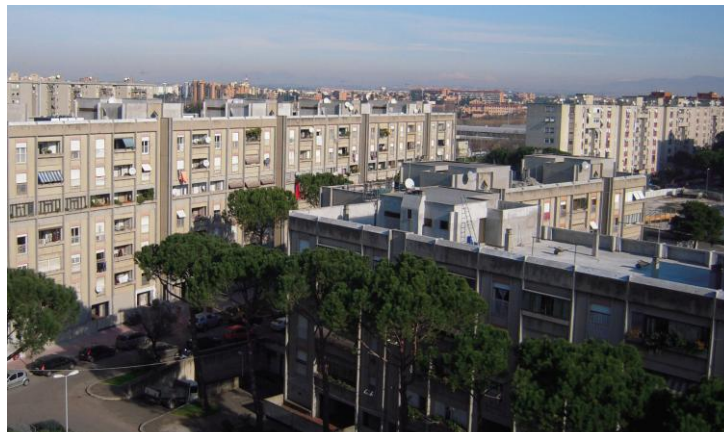
Fig. 1: Buildings at Tiburtino III in Rome.

From a first phase of the investigation it was found that the residential housing stock realized with the first Plans for Economic and public housing (PEEP) presents many porches spaces (approximately 222,000 square meters), today underutilized and devoid of quality, a second phase has made it clear that these spaces, together with those present on the roof top of the buildings, if properly converted, could accommodate new functions or increase the housing stock of public assets.