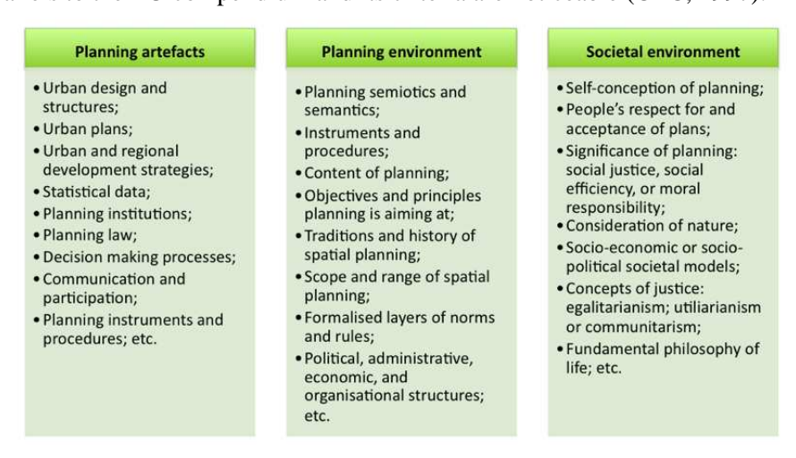
Fig. 3: Specification of the three dimensions of the culturised planning model.

How these three dimensions have been specified in more detail (see figure 3). By looking at these specifications, it becomes obvious that the culturised planning model was inspired by previous approaches to analyse planning systems. Especially with regard to the dimensions planning artefacts and planning environment, parallels to the EU compendium and its criteria are noticeable (CEC, 1997).