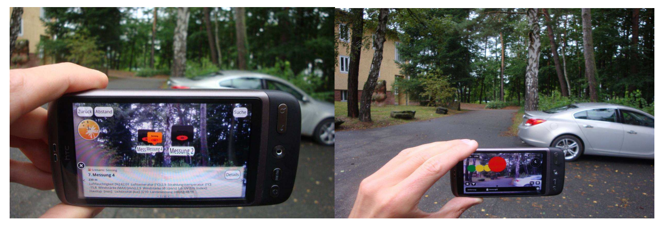
Fig. 2: Implementing sensor based results in WIKITUDE

This scenario shows the presentation of various measuring points of environmental data which were placed at the campus of the University of Kaiserslautern. This scenario is realised using the AR platform "WIKITUDE."<sup>4</sup>