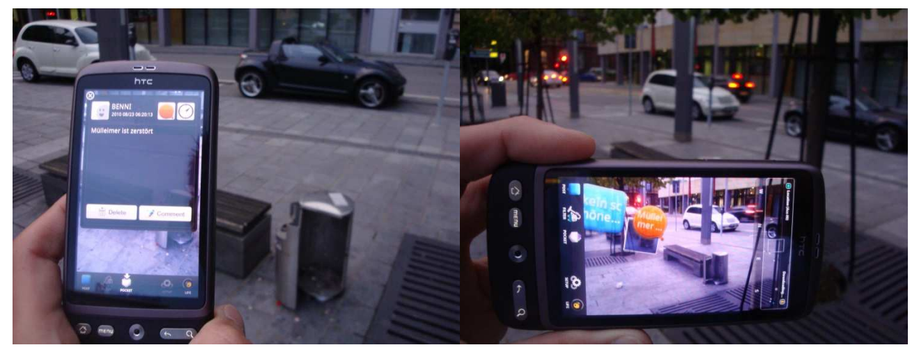
Fig. 5: Tagging 3D damage information by using SEKAI

This scenario is an example for how citizens can lead discussions, exchange sentiments and proposes through the usage of AR technology. These information shout be uploaded and displayed at the location which is in the focus of the discussion. Therefore, this scenario was realized with Sekai (World) Camera.