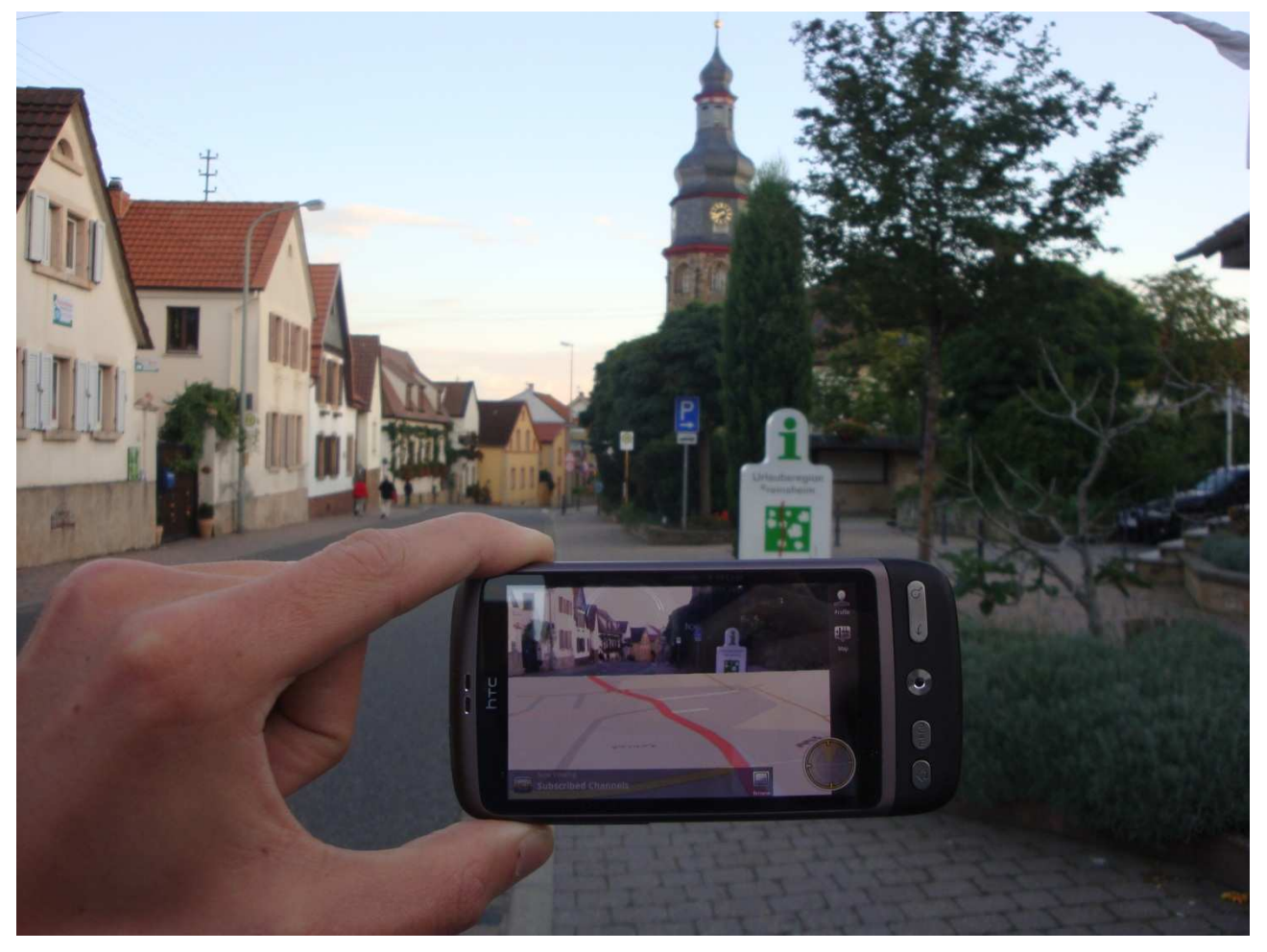
Fig. 3: Overlay of a 2d cadaster information in LAYAR

One of the daily business in planner's life is, how to deal with 2d information and how the 2d maps can be carried in field services. One possibility is to use a so called "moving map" software, where georeferenced maps are available on a handheld or a Tablet PC. The other opportunity could be, to integrate the data set of special maps in a mobile Augmented Reality service. The advantage is, that invisible or hidden attributes can be presented directly in a screen overlay by an Augmented reality browser.