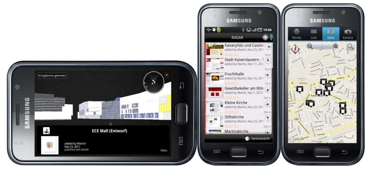
Fig. 6: Sample RADAR geocontents as shown in the list view of ALOQA, the map view of WIKITUDE, and the reality view of LAYAR

With RADAR, users can create augmented reality experiences to easily create augmented reality experiences that can be accessed with different AR browsers. Figure 6 provides an example for the visualisation of geocontents created within RADAR in different browsers