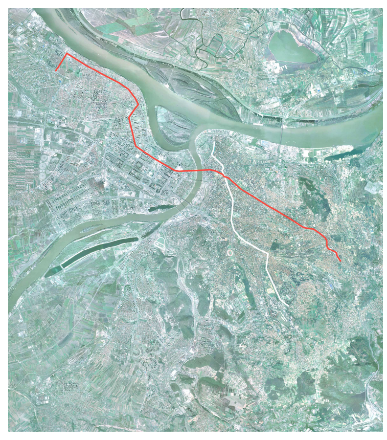
Fig. 4: Belgrade metro lines - 1982 proposal