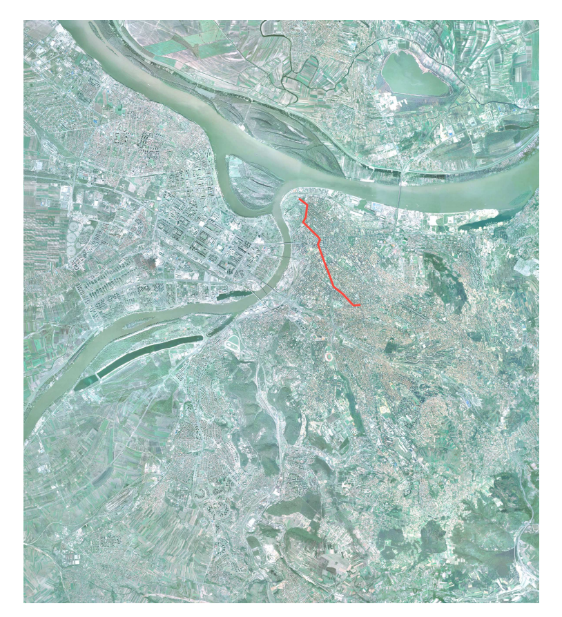
Fig. 1: Belgrade metro line - 1958 proposal

Novel five figures (Fig. 1 to Fig. 5) are completed for this paper, with the objective to enable convenient comparison among four different metro proposals (Fig. 1 to Fig. 4) and light rail proposal (Fig. 5). In these figures, the same aerial map of Belgrade is used as a base. Applying existing data (Dobrovic 1958, Janic 1968, BDBR 1976, Maletin 1993, ABLCB 2008), five different proposals are presented, i.e. the rail lines of each proposal are drawn. Networks, directions and lengths of lines can be easily visually compared by five presented figures.