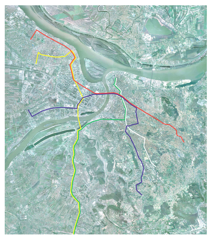
Fig. 3: Belgrade metro lines - 1976 proposal