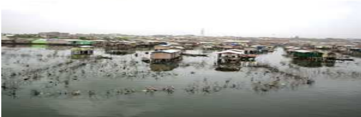
Plate 1: An arieal view of study area; Makoko.

The study area is Makoko in Lagos mainland government area of metropolitan Lagos. It is one of the most urbanized parts of Nigeria. Lagos is the economic hub of Nigeria and houses more than 50% of manufacturing industry outfits. It is the nodal point of all transport modes – air, water, road and rail. Makoko lies within the south-eastern part of Metropolitan Lagos. It is bounded on the North by Iwaya and University of Lagos, at the West by Ebute-Meta, South by the Third Mainland Bridge and East by the Lagos Lagoon. Makoko community sprang up in the early nineteen century. The settlement is surrounded by mass of abundant Akoko trees, wild swamp vegetation and animals. The community is dominated by the Ilajes and Eguns, there are also Yorubas with few Igbos and other ethnic groups. Land ownership is vested in two families namely: the Oloto and Olaiye family. The residents of the area are confronted with severe flooding especially during the wet season.