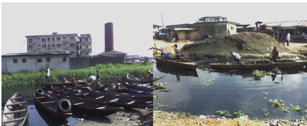
Plate 2 and 3: Showing typical views of fishing activities in the study area as an informal employment and source of income.