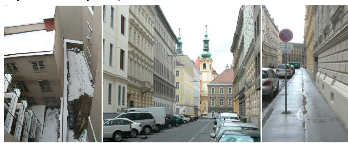
Fig. 3: obstructed inner courtyard - street profile in a Viennese Gründerzeit quarter - narrow sidewalk.

The structural point of departure for use-intensification of the Gründerzeit ground level is in fact particularly disadvantageous. The street-level space created during the Gründerzeit period is dense and receives little daylight. The construction regulations in force at the time provided for roadways five or eight fathoms wide; from 1870 on the requirement was 16 and 12 meters respectively. Consequently, the average width of today's streets is between nine and 16 meters, which in relation to the building height of 24 meters is extremely narrow. Measuring 30 to 35 meters across, Berlin's residential streets are two to three times as wide. As a result, the daylight supply to Vienna's lower levels is relatively scarce. The situation is even worse in the interior courtyards, with light wells and airshafts at minimal size. Additionally, the surface area of the courtyards are often fully built-up or sealed, a circumstance that adds to a detrimental microclimate.