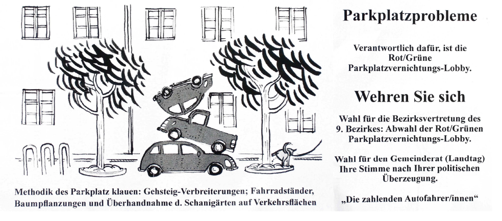
Fig. 4: Original handout by the "Motorist Lobby" during the election oft the municipal council Vienna, in Oct. 2010

In order to develop a sustainable solution to the transit problems that plague the Gründerzeit street level environment, it will be necessary to employ a systems-oriented view of mass mobility. Such a view will take into consideration causes, effects, benefits, and costs as well as consequential costs, resulting in a factual analysis of systemic interrelations and a suitable spectrum of key measures identified.