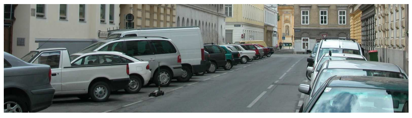
Fig. 1: Street filled with parking spaces