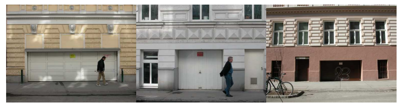
Fig. 2: small garages, and basement entryways

However, land use conflicts that one might expect from this imbalance do not actively arise; instead, there exists an a-priori assumption in favor of a medium that from a social science point of view is elitist, benefiting only part of Vienna's population while paid for by everyone and requiring substantial public subsidies. The average car owner covers only 40 % of the costs he or she causes. This is the conclusion of a comprehensive cost analysis carried out by Gerd Sammer, which includes all the consequential impacts of car use including noise, harm caused by exhaust fumes, public health impact, greenhouse effect, CO<sub>2</sub> emissions, etc. (compare: Sammer, 2007).