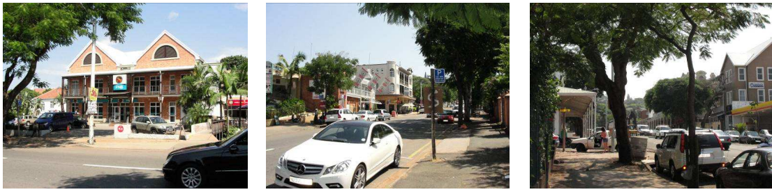
Figure 4: Street character, Figure 5: Street Texture, Figure 6: Mixed use development

With positive and strategic objectives the Florida Road has become one of the good examples of revitalisation and gentrification of old precincts/neighborhood that have been transformed into the integrated whole in Durban city. The blending of the old and the new architecture, space and people has given a new meaning with a well articulated aesthetics quality in place making for a multicultural society to create a livable space (Figure 4, 5 and 6). The open public space that was once used by one population group based on the apartheid planning ideology has also been transformed to function as a multi-racial social space.