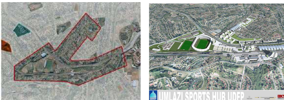
Figure 1: KwaMnyandu node Site Location, Figure 2: Concept Plan

The city of Durban is located on the east coast of the South Africa’s Province of KwaZulu-Natal covering an area of 2 300km 2 . The city is a microcosm of the typical former and post-apartheid cities of South Africa. At the height of formal apartheid in the mid-1980s, the majority of the city was composed of three types of areas: urban African townships, located in peripheral areas far from the core, where 75% of the Africans in Durban lived, core and suburban areas composed nearly exclusively of whites or Indians; and core, primarily white communities (Schensul, 2008). Most notable projects to transform space post-apartheid in the city of Durban to date include the Florida Road Heritage Precinct project an inner city neighborhood revitalisation project, the Durban Point Water Front redevelopment project which is an inner city redevelopment project, the Bridge City project a new mixed node for integration located on a buffer zone that separated the three main races, blacks and whites during the apartheid era and the Umlazi Town centre upgrading project a township town centre upgrading project.