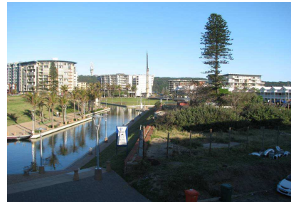
Figure 7: Point Waterfront Revitalisation Revitalisation Master Plan Figure 8: Point new development built environment

To realize the revitalisation of the Durban Point area and city centre the following design principles were adopted (Figure, 7 and Figure 8); an urban intensity of scale and an urbane character of development, a structure based on canals, water bodies, boulevards, vistas, urban squares, avenues, lanes and parks, all creating memorable places and an emphasis on mixed-use developments which encourages the integration of retail, commercial, office, entertainment and residential activities including safe, quality pedestrian movement spaces, and clean attractive and secure environment. But, regardless of all this, development integration has not been achieved by the revitalization of the Point area. The water canal next to the Indian Ocean is not really necessary as it increases the cost of the development, thus excludes most of the inhabitants of Durban who are in the low income bracket. A well positioned large pedestrian movement and square with hard and soft landscape would have created a more integrated urban character. Thus accordingly the key criticism of this project is of target group of rich affluent people which excludes the rest of the population. This is because prime land of estate is converted to expensive water use that requires high maintenance. Thus hybrid African cities concept has not been realized because of the exclusion of the poor and the determinist nature of the property markets and competitiveness of the city using grand architecture.