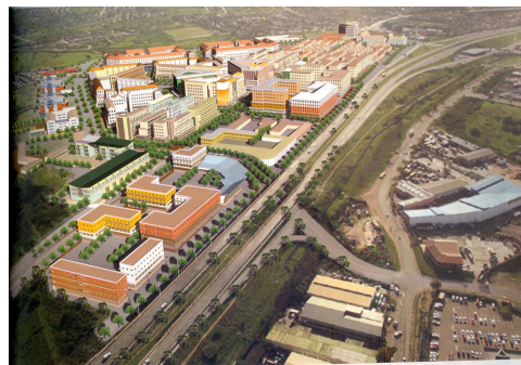
Figure: 3 Bride City Concept

The Bridge City project was initiated to directly address the issue of buffer zones that physically separated residential areas of different races leaving them with poor access to socio-economic facilities under apartheid spatial planning in South African cities. The Bridge City uses the buffer zone to develop a new town centre for integration. It is located 17 kilometers in the North West of the Durban city centre connecting the townships of Phoenix (predominantly an Indian residential area during apartheid) and Inanda, Ntuzuma and KwaMhashu (INK)(mainly black residences during apartheid) Figure 3. The municipality of Durban also noted that it will be a catalyst for economic growth and the empowerment of surrounding communities by improving their access to public transport and opportunities to work, travel, shop and do business within the INK area, via a symbiotic relationship between the public and private sectors. Thus foster the integration of the divided spatial form and creating mixed use residential area for use races.