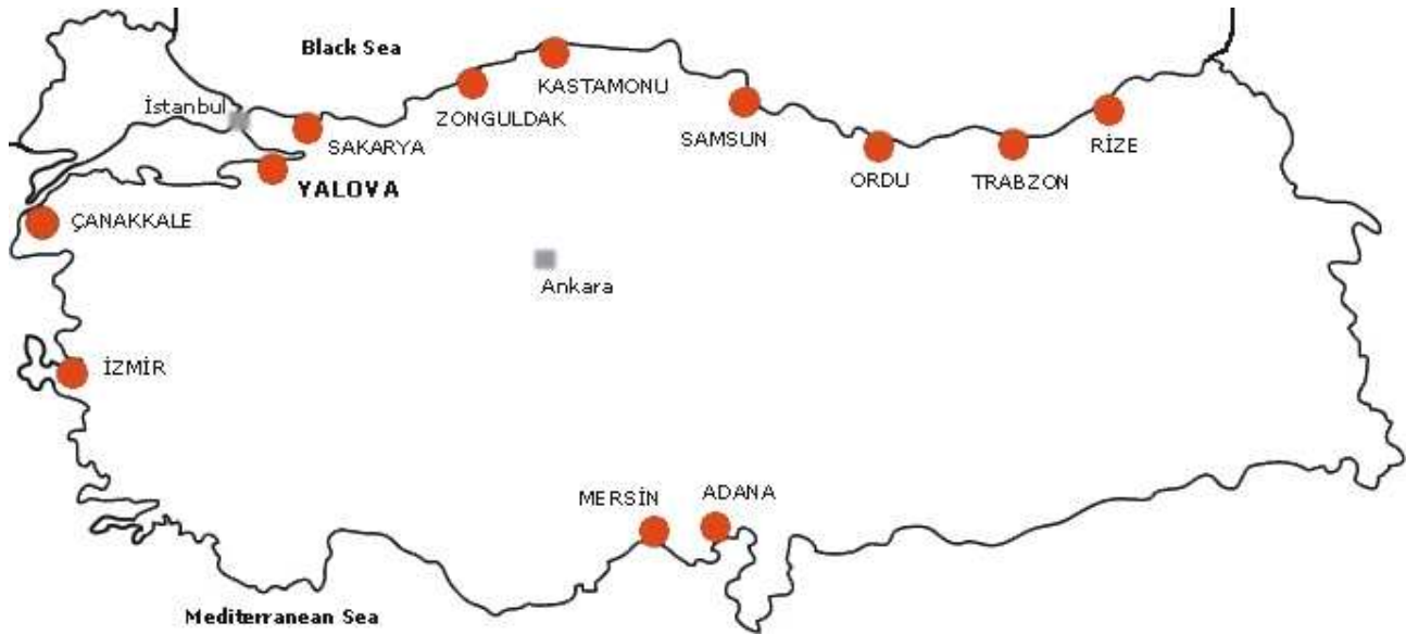
Fig.4: Illustration of new shipbuilding zones in Turkey.

These demands imply an investment which is of capacity to employ around 8000 workers.