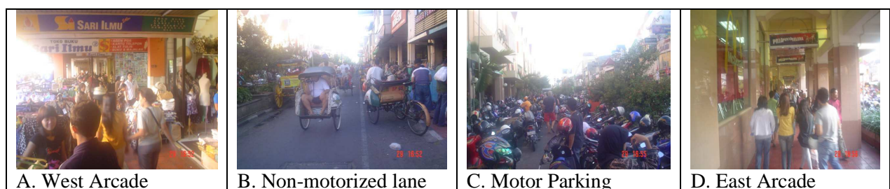
Figure 2. Some views of the landscape of Malioboro Street based on the Figure 1

Based on the data in Table 4, the existence of street trading on the Malioboro Shopping Arcade support the aspect the place for people delivered by the English Partnership (2005), where Figure 2 shows many people are on the arcade interact with the vendors. This is also supported by the number of motorcycle parking on