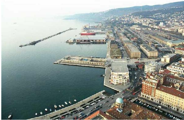
The old harbour of Trieste, http://www.porto.trieste.it/custom/sez_archivio1.php?id=33

The PO_VE_TS (Porto Vecchio di Trieste) research project is about the old Austrian harbour of the former empire in the heart of the city of Trieste. The old harbour, in disuse since the 80es, is a coastal strip of land on the Adriatic Sea, covering an area of approximately 700.000 m 2 and some 1.000.000 m 3 of built structures sealed of from the city by the railroad system.