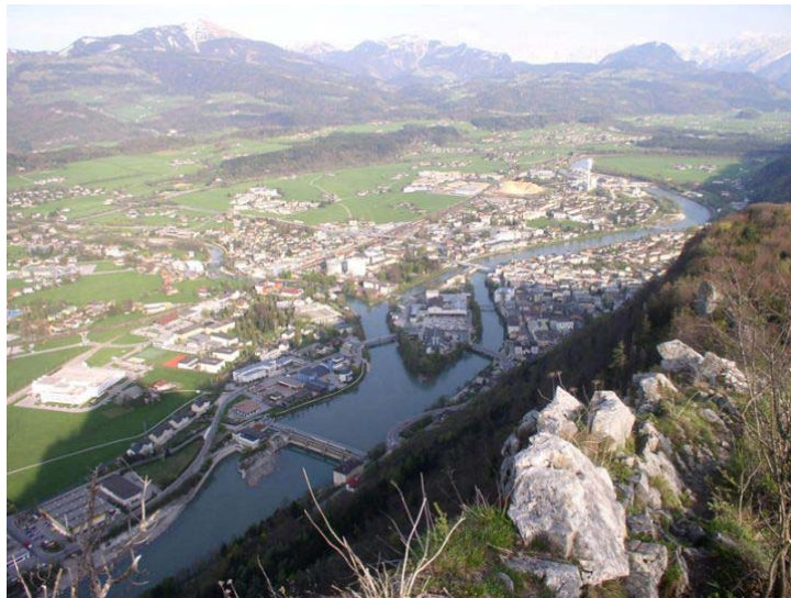
The city of Hallein