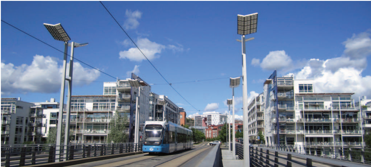
Fig. 3: Hammarby Sjöstad, a TOD-influenced brownfield redevelopment area, houses 20,000 inhabitants and constitutes a mix of TOD and green urbanism.

approach has blurred the previously sharply defined borders of the inner city. TOD is seen as one of several complementary tools which could potentially be adopted but by no means the leading one.