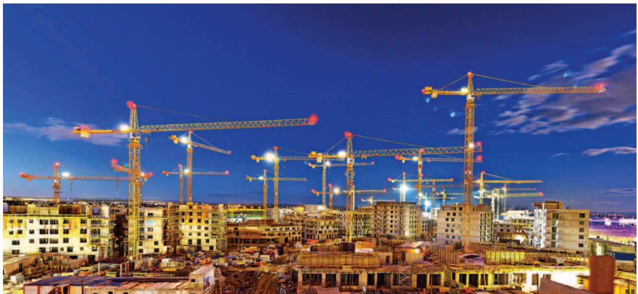
Fig. 4: Vienna's Seestadt Aspern, a TOD site still under development, is planned to house 20,000 residents (Source: Liebherr-Werk Bischofshofen GmbH).

In the first few post-war decades, urban planning in Vienna was heavily preoccupied with reconstruction of the building stock destroyed in the war. Large housing estates were also developed on vacant land south and east of the city, the dimensions of which were reminiscent of Eastern European socialist estates. They were based on TOD principles in the sense that public transport was provided. At the time, Vienna was an exemplar of a top-down, corporatist form of social-democratic urban governance, based on rigid master-planning (planning environment). The city expanded in a circular fashion along its historical radial structure (planning artifact). In the 1970s and 1980s, Vienna experienced a wave of urban renewal to counter urban deterioration, which was becoming visible in the cityscape of the centre, but urban renewal took a gentler form than the demolition and rebuilding works occurring elsewhere.