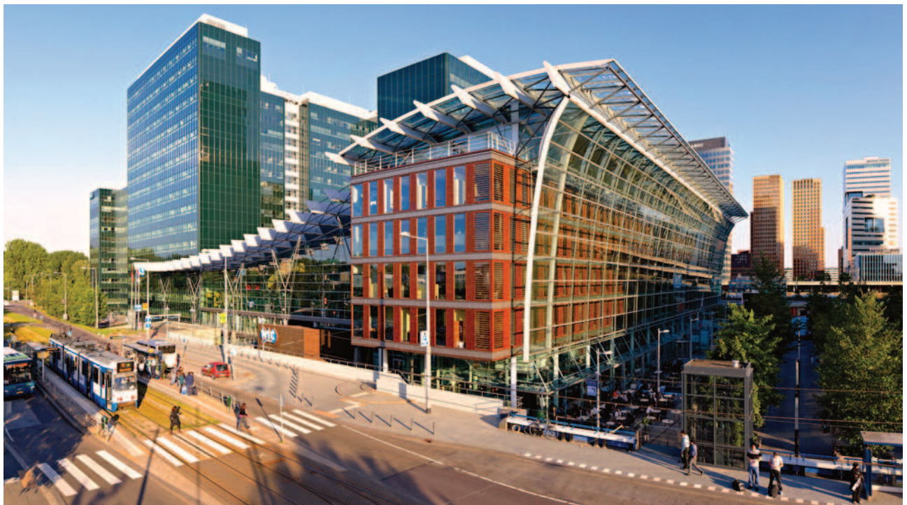
Fig. 2: Amsterdam's Zuidas district, a TOD site centred around Amsterdam South Station.