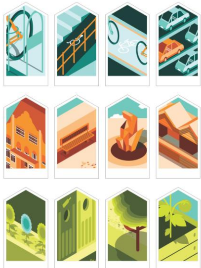
Fig. 3: Playing Pop-up Pest