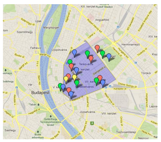
Fig. 1: The playing field of Pop-up Pest designed by Dóri Sirály (left)