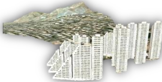
Figure 2: a view of future buildings (derived from Google Earth software)

Use of uniform repetition of buildings (construction of uniform buildings) is one of the other subjects studied in this field. Residential and modern and future high buildings beside Evin Hotel (figure 2) and Ekbatan Residential Complex as the fourth Strategic Rings are of these class. Construction of spaces with geometrical and regular shapes facilitates identification of target from the surrounding environment.