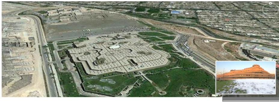
Figure 1: a view of National Iranian Library building (derived from Google Earth software)

Use of uniform repetition of buildings (construction of uniform buildings) is one of the other subjects studied in this field. Residential and modern and future high buildings beside Evin Hotel (figure 2) and Ekbatan Residential Complex as the fourth Strategic Rings are of these class. Construction of spaces with geometrical and regular shapes facilitates identification of target from the surrounding environment.