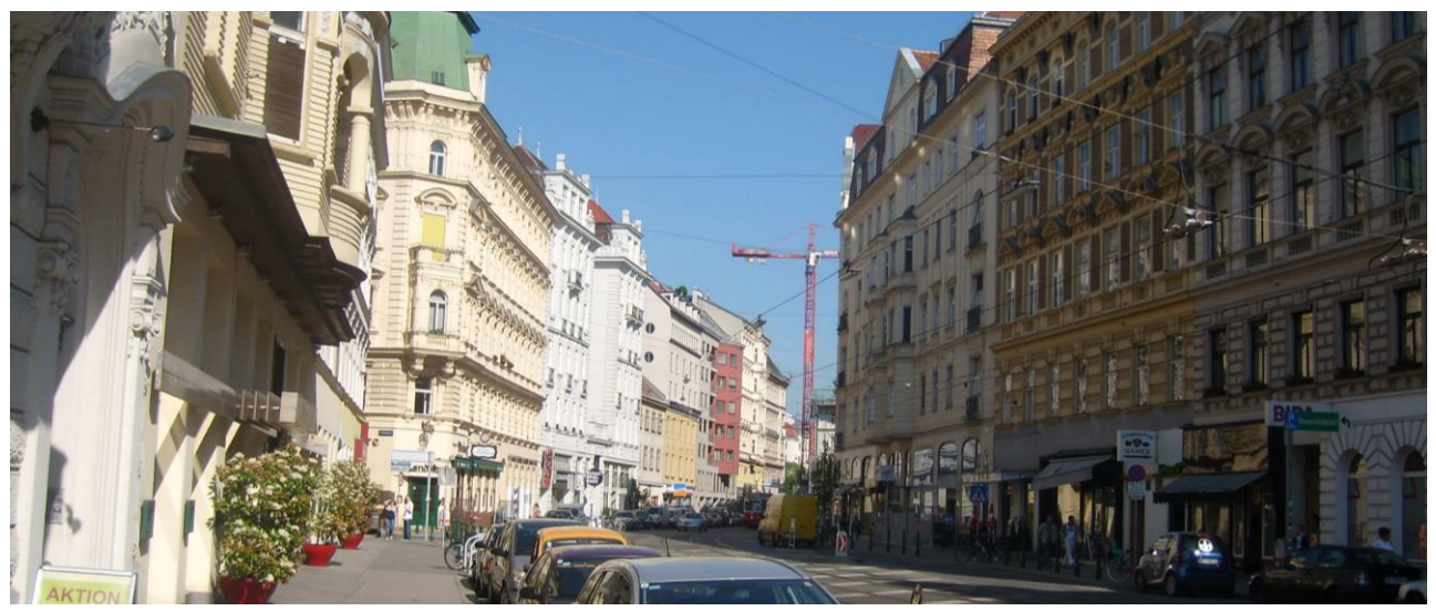
Fig. 1: Gründerzeit houses in Viennas 9th district

The architectural concept that offers the solution to this task does not have to be complex nor does it have to be expensive. Actually Vienna already disposes such an architectural structure that evidently does fulfil the mission: The Gründerzeit architecture easily performs the task of being use-neutral.<sup>1</sup>