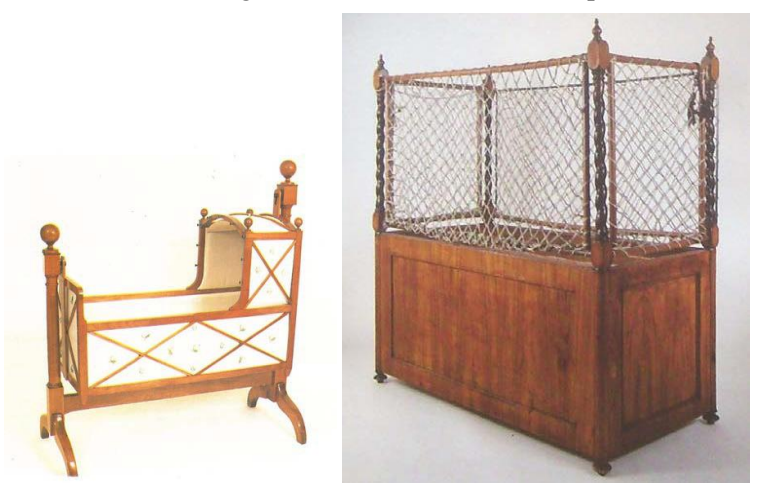
Fig 3: children's furniture; left: lowered cradle from the Biedermeier era (around 1820/1825) (Pressler/Straub, 1991, p. 94), right: child bed with high base from the Gründerzeit era (around 1860) (Ottillinger, 2006, p. 134)

From this point of view, small children were thought to be particularly at risk, which is why the practise of mounting cradles and children's beds on high base frames became widespread: