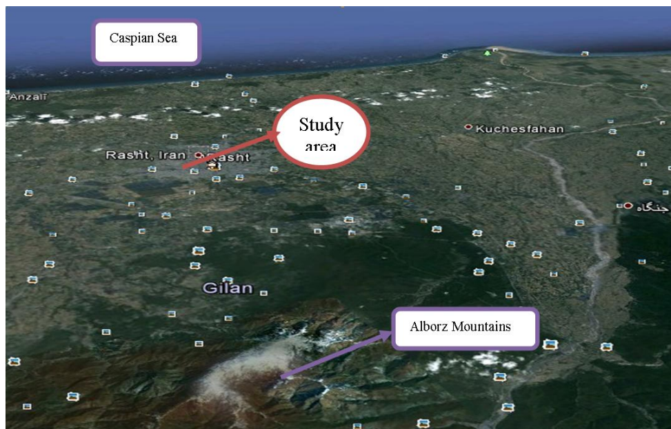
Fig. 1: Rasht location

Rasht is the capital city of Guilan province in north of Iran. Rasht is located in 49° and 36' by east, 37° and 16' by north GMT near to Caspian Sea. (Fig.1)