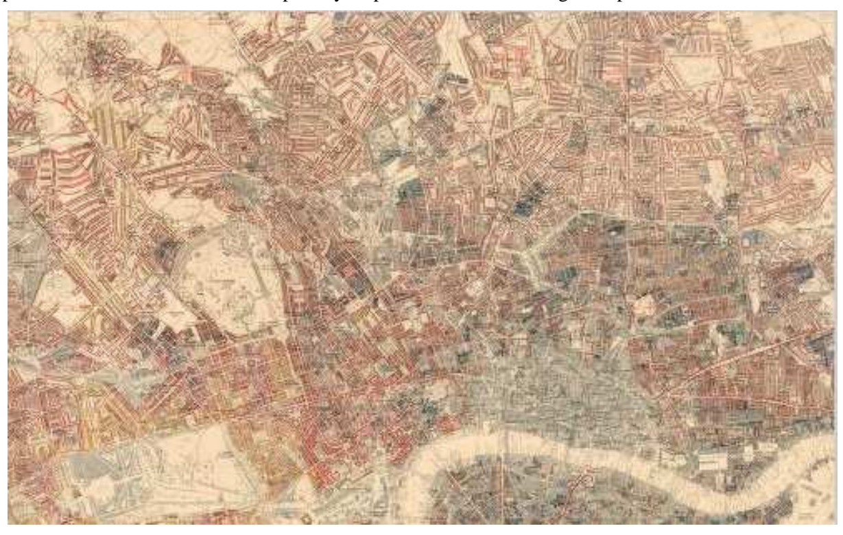
Fig. 1: Charles Booth map of poverty 1898-99 (the darker the poorer the areas). British Library

Industrialisation and urbanisation have evolved unevenly in space and produced wealthy as well as impoverished areas. Charles Booth's poverty map of London<sup>4</sup> is a telling example.