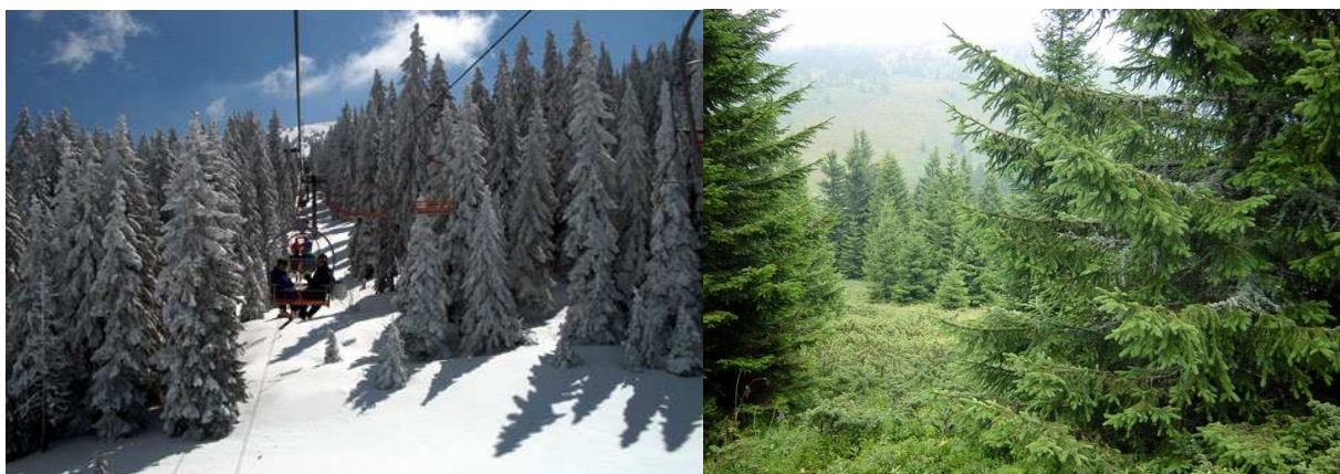
Fig. 1: Natural beauties of Kopaonik mountain