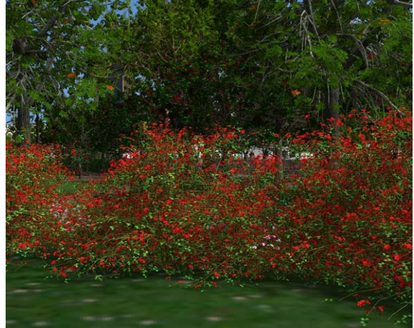
Image 11: Platzspitz park - Spatial arrangements: foreground enclosure