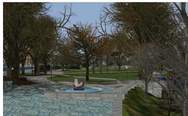
Image 5: Visualization of urban park – winter- in detail Carpinus B.