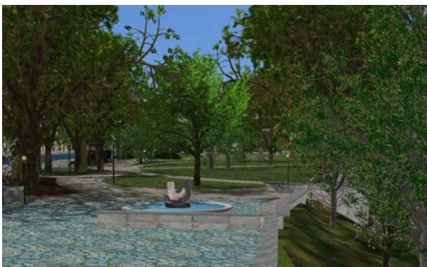
Image 4: Visualization of urban park - spring - in detail Carpinus B.